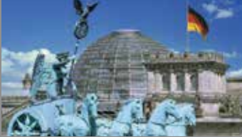
Quadriga in front of the Reichstag