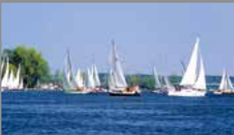
Excellent leisure opportunities in the region