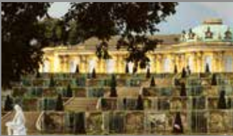
Sanssouci Palace in Potsdam