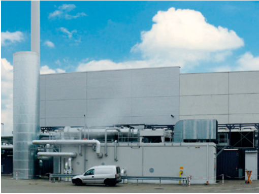
Danpower biomethane cogeneration plant on the site of the wind turbine blades producer Vestas Blades