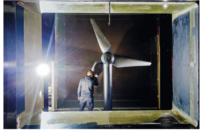
Optimization of wind turbines in the wind tunnel at TU Berlin